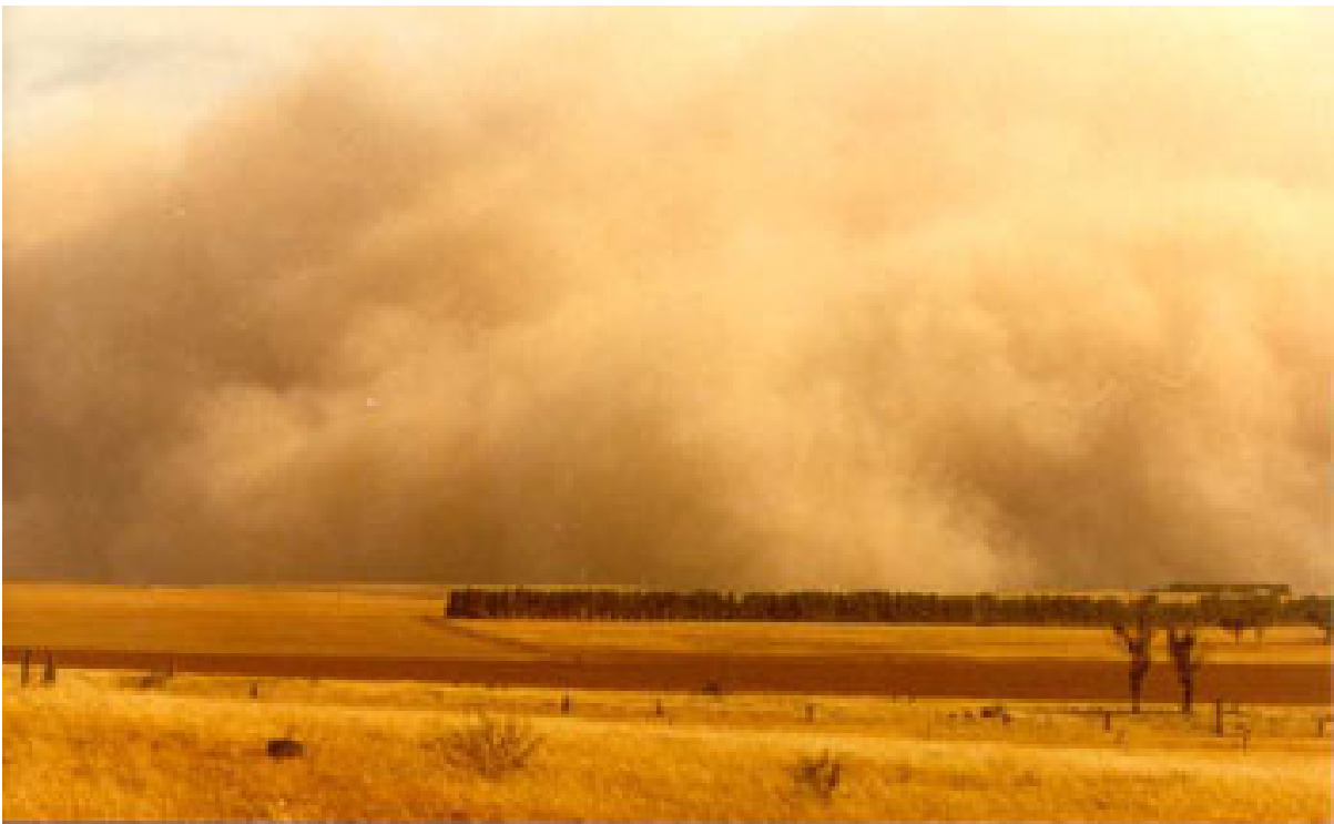
Dust storm caused by wind erosion of loose soil