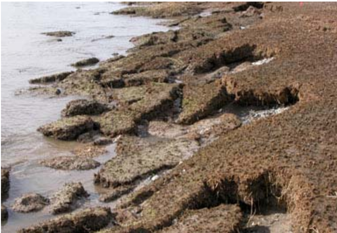
Shoreline erosion caused by the ocean