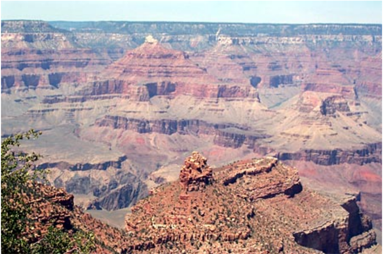
The Grand Canyon, formed by erosion from water and wind