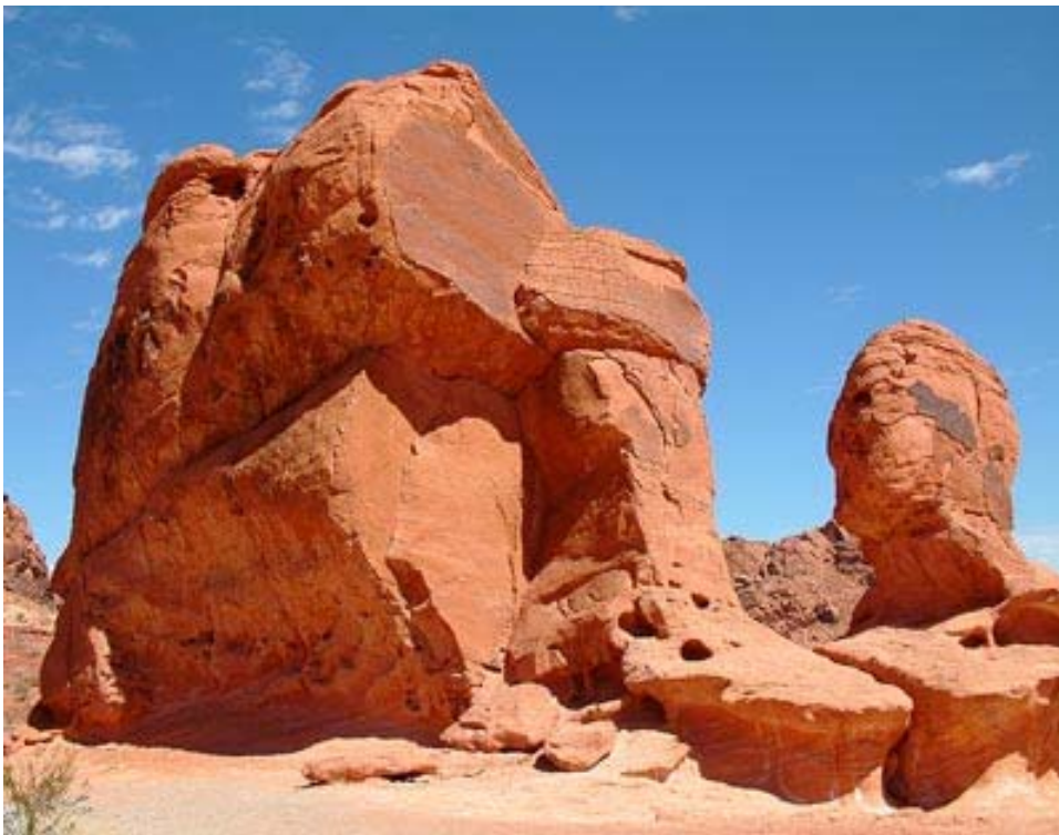
Extreme erosion caused by wind over long periods of time