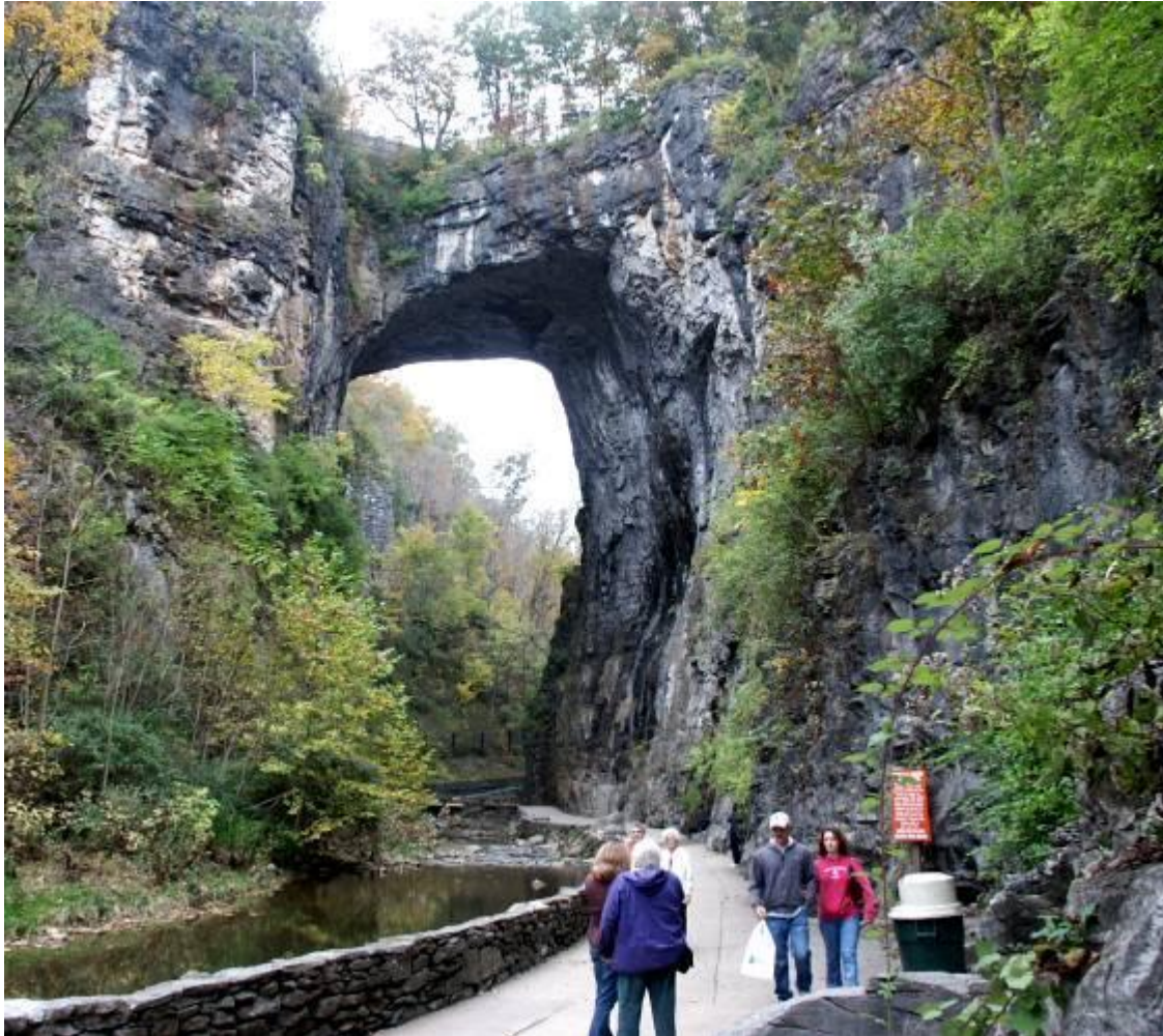
Natural Bridge, Virginia, formed by erosion from river water