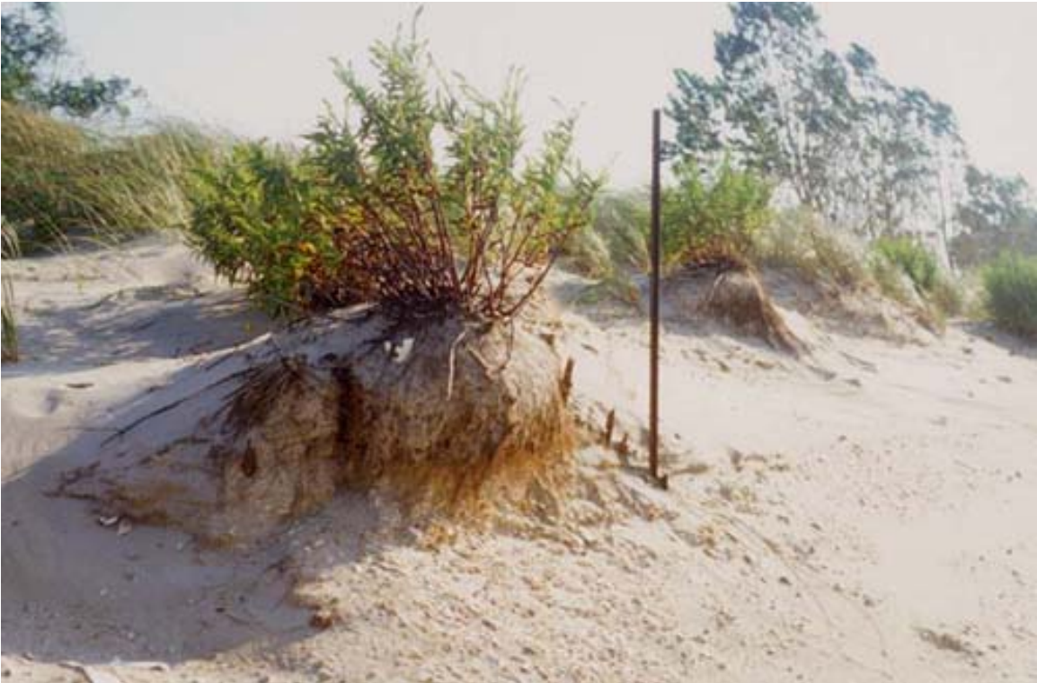
Wind erosion of sand dunes