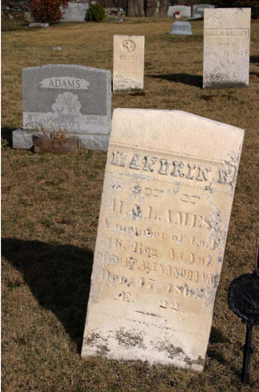
Chemical and mechanical weathering, caused by rain and wind