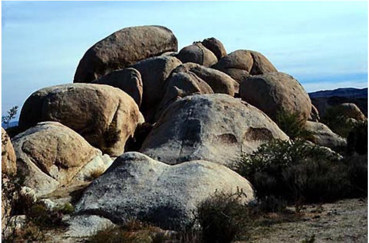
Mechanical weathering by frost and ice, causing the rocks to break apart