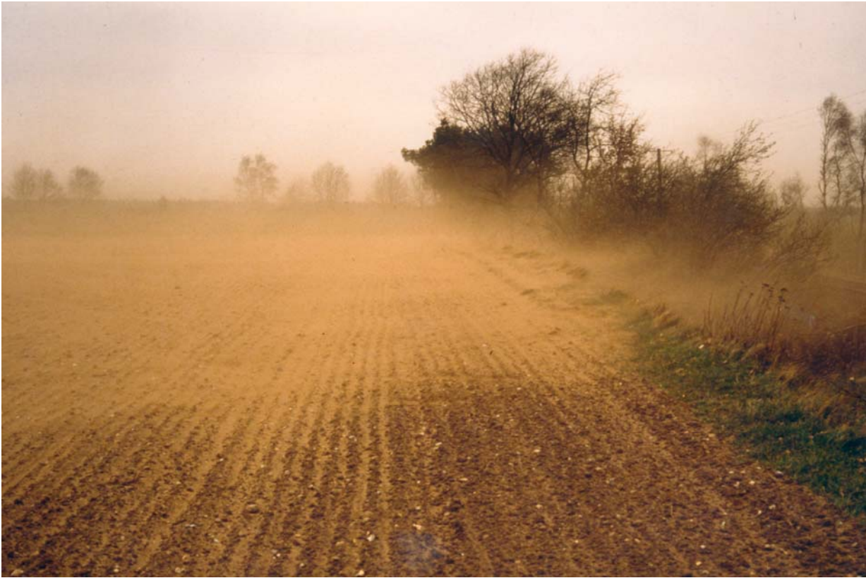
Erosion in fields caused by wind blowing loose soil