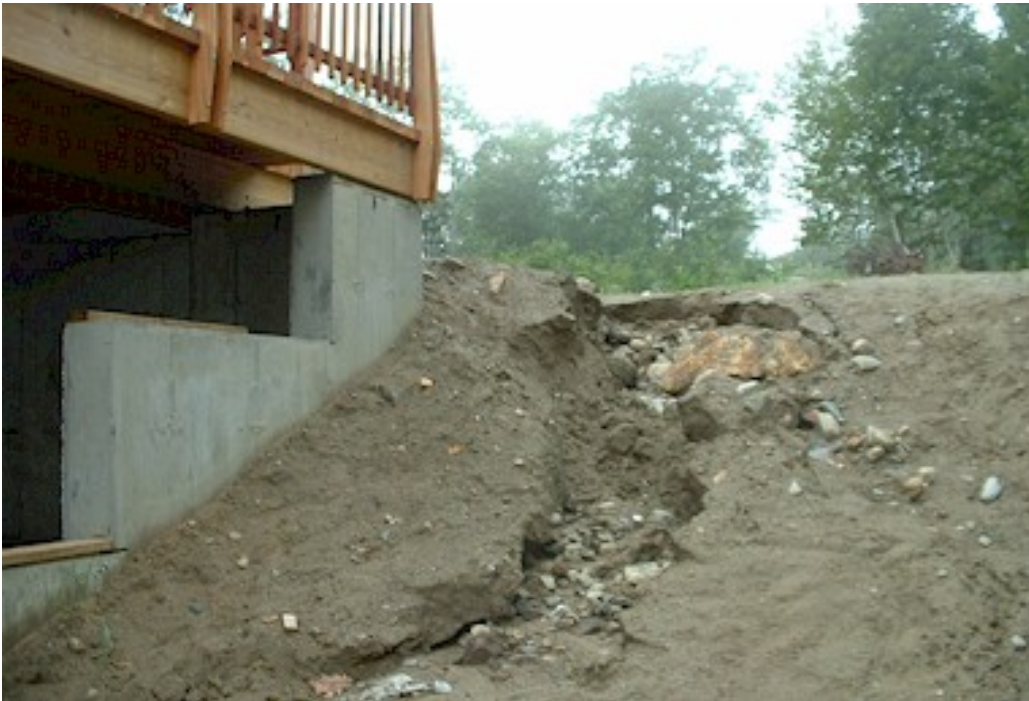
Soil erosion caused by rain