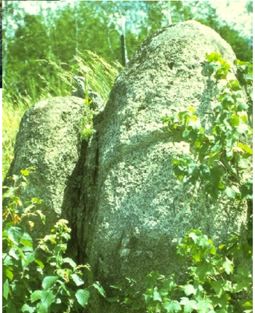
Mechanical weathering caused by plant roots, lichens, and mosses on the rock