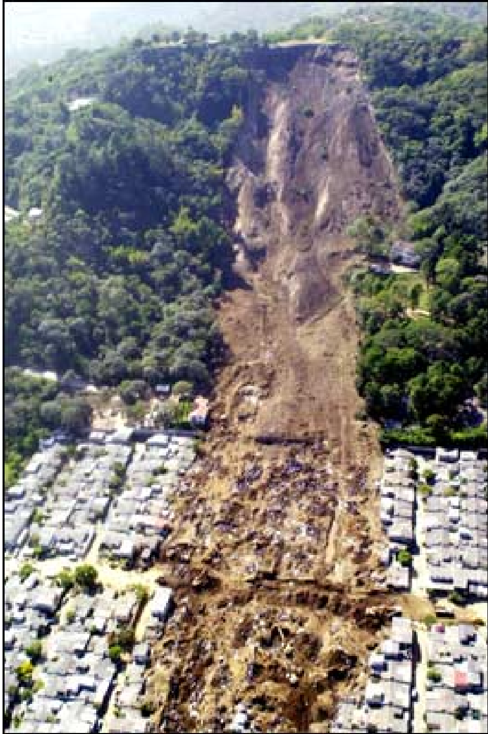
Mechanical weathering and erosion caused by a landslide