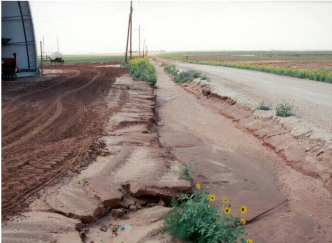
Erosion caused by flooding