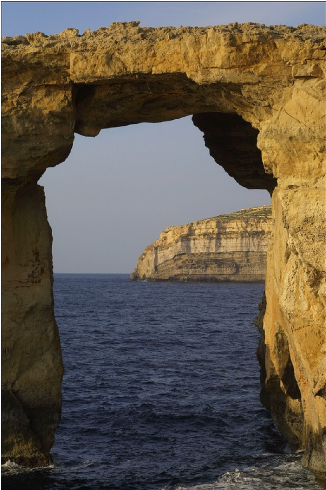
Erosion by waves, forming a natural bridge